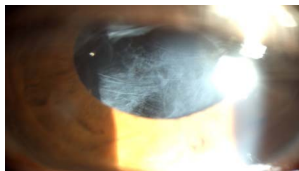
Figure 2- Slit lamp view of patient's right eye one week after intravitreal injection of Avastin shows complete regression of capsule neovascularization.