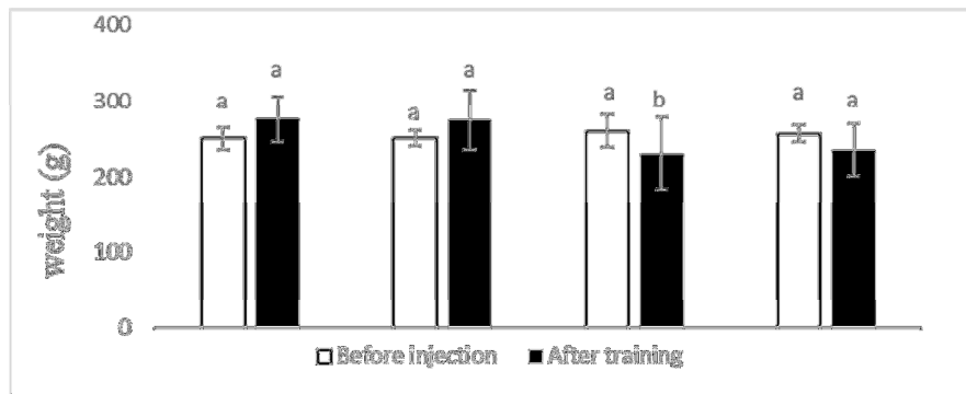
Figure 2. The difference of the weight in studied groups

rest of the groups, which is significantly different ( P -value: 0.007) (Figure 3).