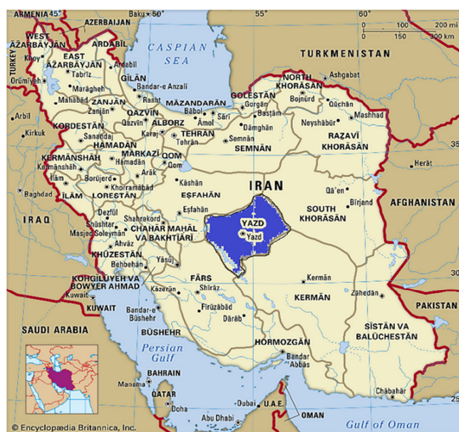
Figure 1. Location of Yazd, Iran

In this study, patients were collected from one source (Diabetes Research Center). To reduce the selection bias, all endocrinologists, internal and general practitioners were asked to refer