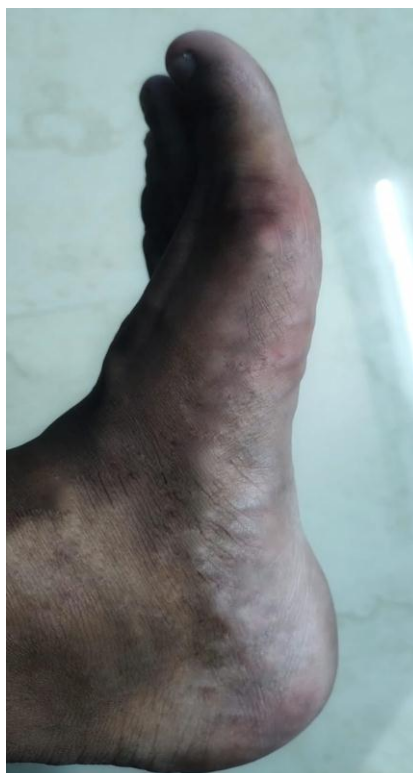
Figure 2. Recovery after treatment

Pemphigoid was 1st described by Lever in 1953, which is a disease characterized by bullous formation due to sub-epidermal detachment (5). There can be differential diagnoses of pemphigus foliaceus, pemphigus herpetiformis, linear IgA bullous dermatosis, eczema, urticaria, and prurigo. The diagnosis of BP was confirmed by Direct immunofluorescence and histopathology confirmed a definitive diagnosis of BP (5). In our case, the oral re-challenge test with vildagliptin was not done on ethical grounds. Causality assessment was done by both Naranjo and WHO-UMC scale and it was found to be a “probable” category in both. According to Vigiacess, a total of 740 cases of vildagliptin-associated bullous pemphigoid have been reported to date. The patient was treated with antihistamines, steroids, and conservative management.