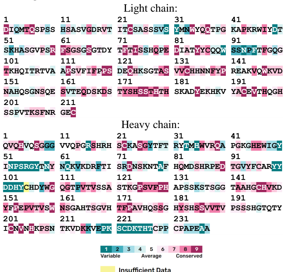
Figure 3. Ranibizumab conservation of amino acid positions evolution by Consurf server. The nine-color conservation scores are projected onto the 3D structure of the antibody and the colored protein structure is shown by FirstGlance in Jmol.